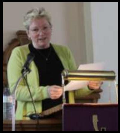
Giving an Irish Blessing.